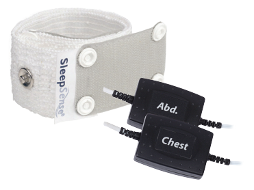
The JET respiration option provides tidal volume and respiration rate