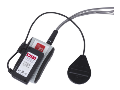
The JET BP option acquires continuous blood pressure data