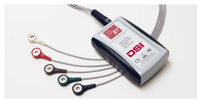
The JET device provides clean ECGs with clear morphologies at a size and weight that minimize animal impact