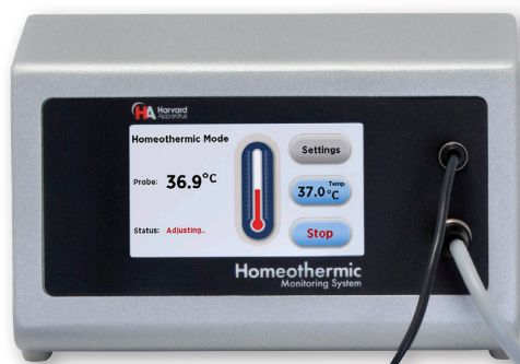
Control Unit with Probe and Heating Pad