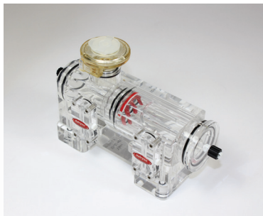
The mouse NAM plethysmograph

Buxco FinePointe Station software presenting data from a Buxco FinePointe NAM Site: reading thoracic, nasal, and volume signals. The bottom left of the screen displays the trend graphs for Tidal Volume and Specific Airway Resistance. The table displays the current numerical data derived from the signals presented above. Report measurement periods are highlighted in purple.