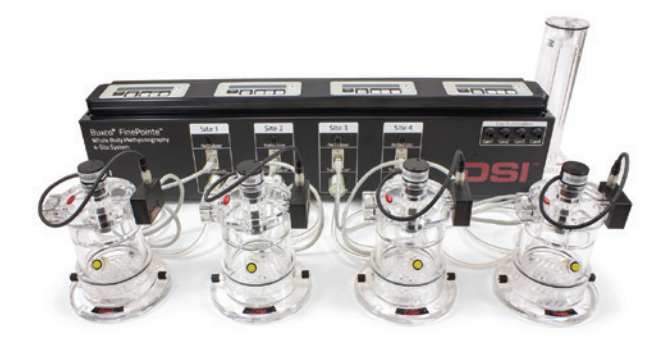
Whole body plethysmography