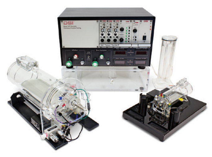
Pulmonary function test