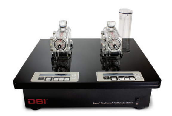
Non-invasive airway mechanics

DSI has the tools you need for your respiratory research. All Buxco® respiratory products are compatible with the powerful, easy-to-use, FinePointe software for collecting, analyzing, and reporting data.