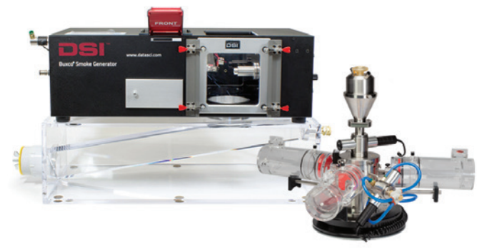
Smoke generator and inhalation tower