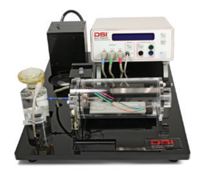
Resistance and compliance