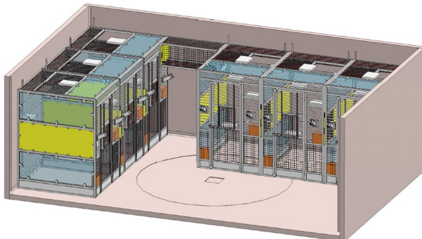
Figure 1: Primate housing at Biotrial designed to comply with European Directive 2010/63/EU

Biotrial recently added new non-human primate research units to its facility that met its stringent requirements for good science and animal care, while positioning Biotrial as an industry leader for large animal monitoring capabilities among CROs. As part of this expansion, Biotrial implemented DSI’s PhysioTel Digital large animal telemetry platform to better comply with European Regulations for animal housing.