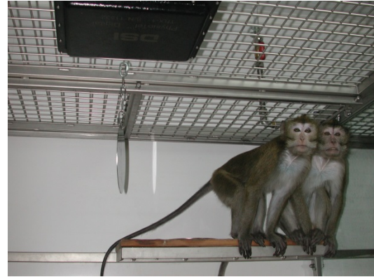
Figure 2: Pair-housed primates in home cage