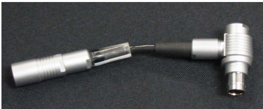
Right Angle Connector for RMC-1 – Part Number 274-0025-001